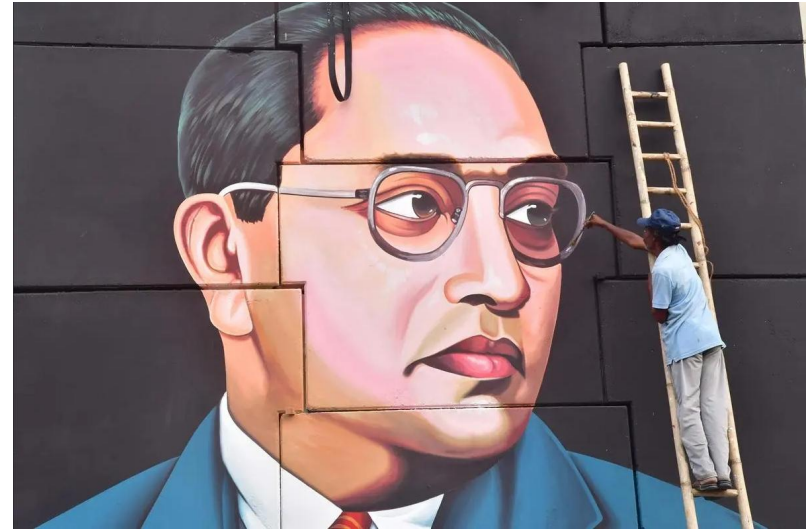
An artist painting a portrait of Dr. B.R. Ambedkar on a wall near Vijayawada, Andhra Pradesh, on August 26, 2022.