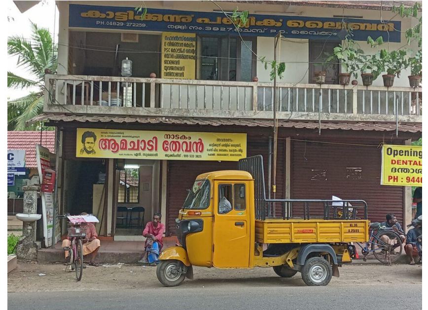
The Kattikkunnu Public Library close to Vaikom has come up with a play titled 'Amachady Thevan' on the occasion of the centenary of Vaikom Satyagraha, as announced in the hoarding put up in front of its office.