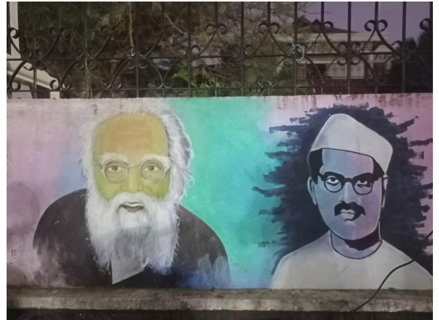
A painting of Periyar and George Joseph on the outer walls of the Vaikom Sathyagraha Smaraka Gandhi Museum