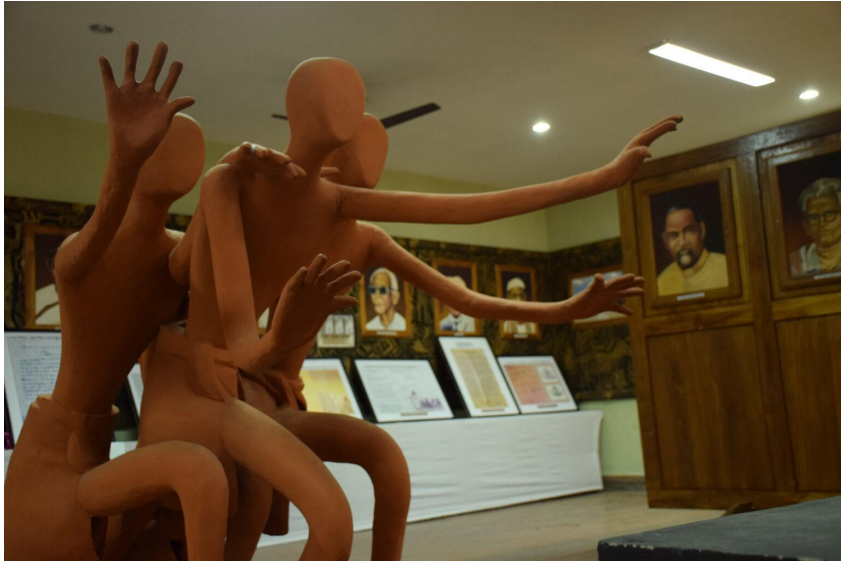
A sculpture of the Satyagraha volunteers which was part of the old Satyagraha Museum at Vaikom