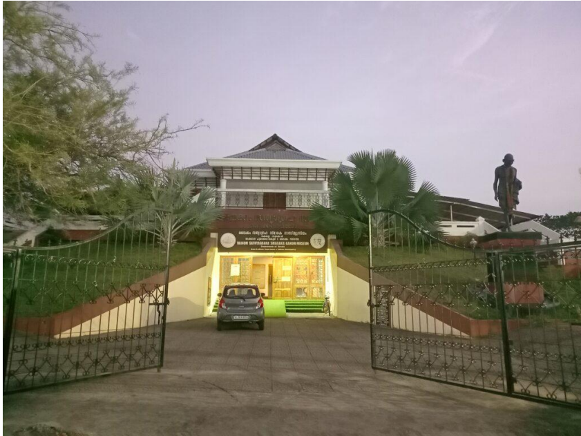
The Vaikom Sathyagraha Smaraka Gandhi Museum, by the Department of Archives of the Kerala Government and the Vaikom Municipality, which was inaugurated in January 2020.